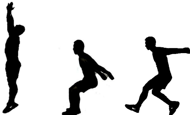
Fig. (1). The experiment movement from right to left: Single foot step, immediate stop, feet off-ground Changes of the frictional force in the longitudinal direction